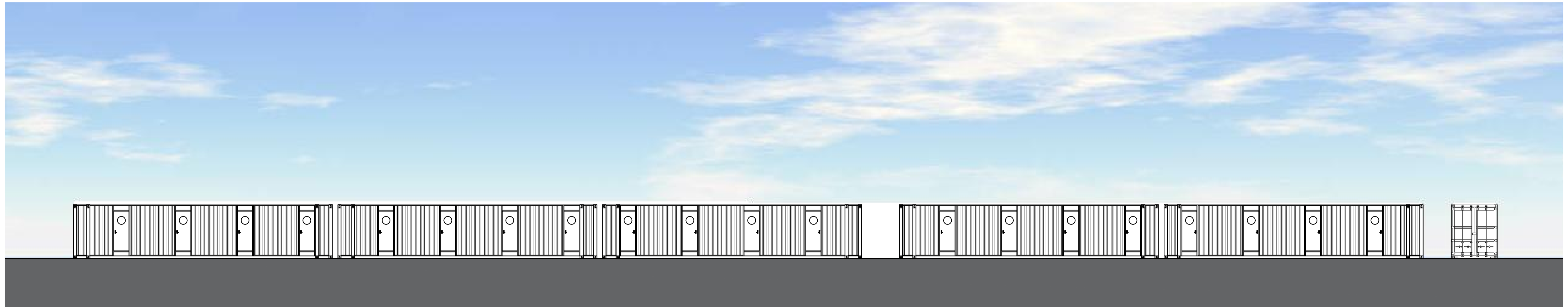
Typical Front Elevation 1:100